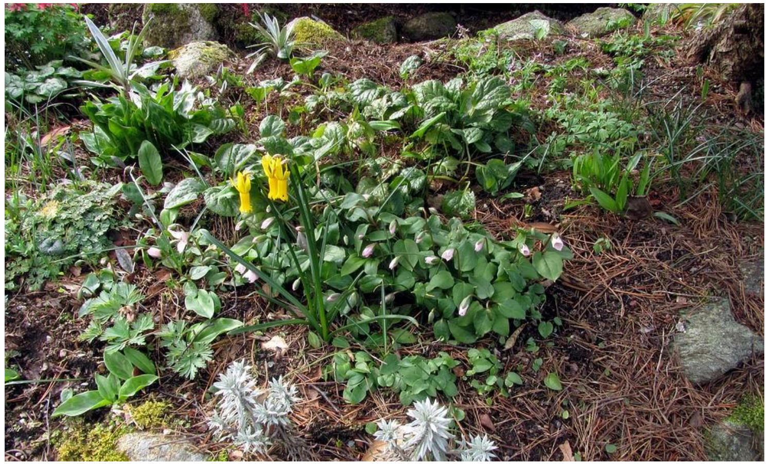
The self-sowing theme continues all over the garden including around this grouping of Trillium rivale where if you look carefully you will spot lots of seedlings from newly germinating to three year olds.