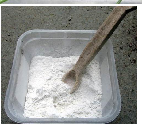
Feeding with Potassium supplement

Now the bulbs have completed their leaf and stem growth they have no further need for nitrogen so I will switch my feeding to a potassium supplement - this is the main nutrient the plants need to form next season's flower buds which will be forming now as the current flowers are fading. I simply sprinkle a small amount of the white powder onto the surface of each pot then water it through – if the bulbs stay in growth long enough I will add a second dose in around four to six weeks' time.