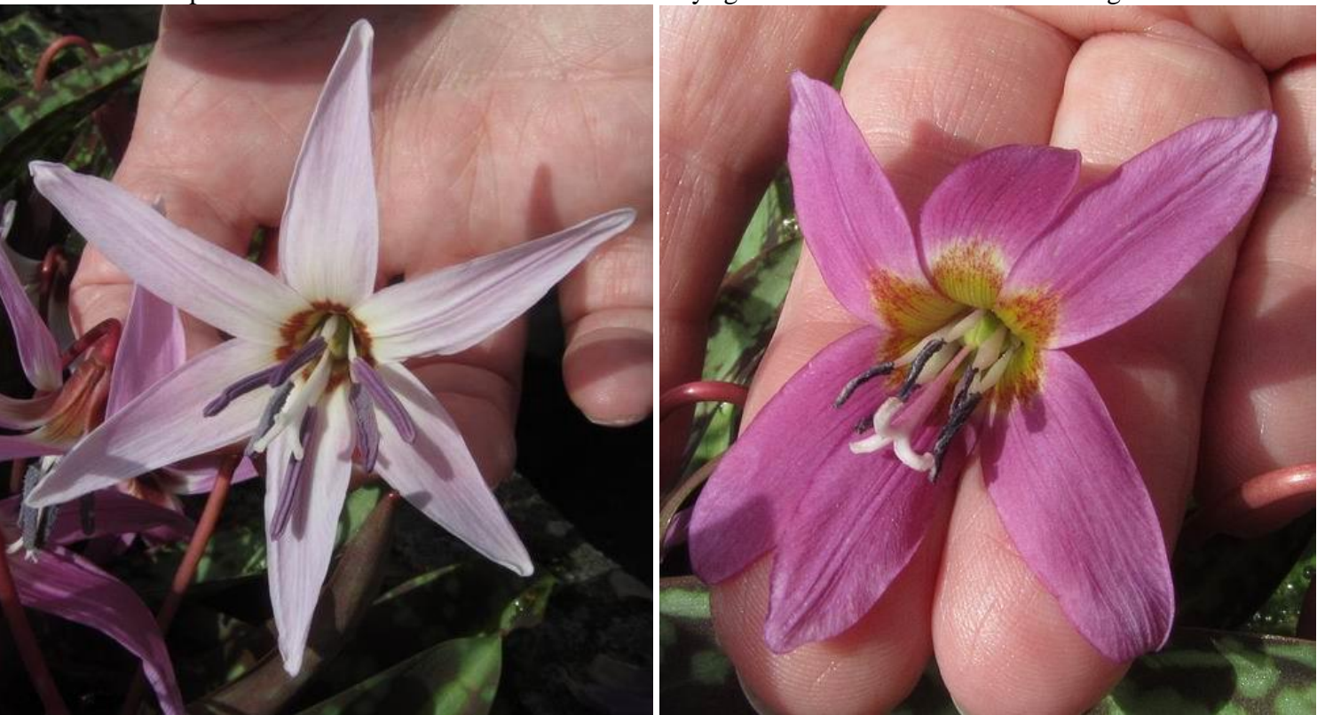
The extremes of those that are in flower just now range from the one on the left which is almost white, with just a pink tint, to the darker one on the right which is not as dark as those that flowered a few weeks ago.

This plunge basket of Erythronium dens-canis displays a wide range of variation in flower shape and colour as well as flowering time - the earliest to flower were the very dark ones I showed a few weeks ago and those are now over, others are still emerging. They was raised from our own garden seed and it is this variation that makes me so keen on raising my plants from seed – I much prefer these mixed plantings over a clonal group not just for the variations but also because pollination between mixed clones will always give a better chance of seed setting.