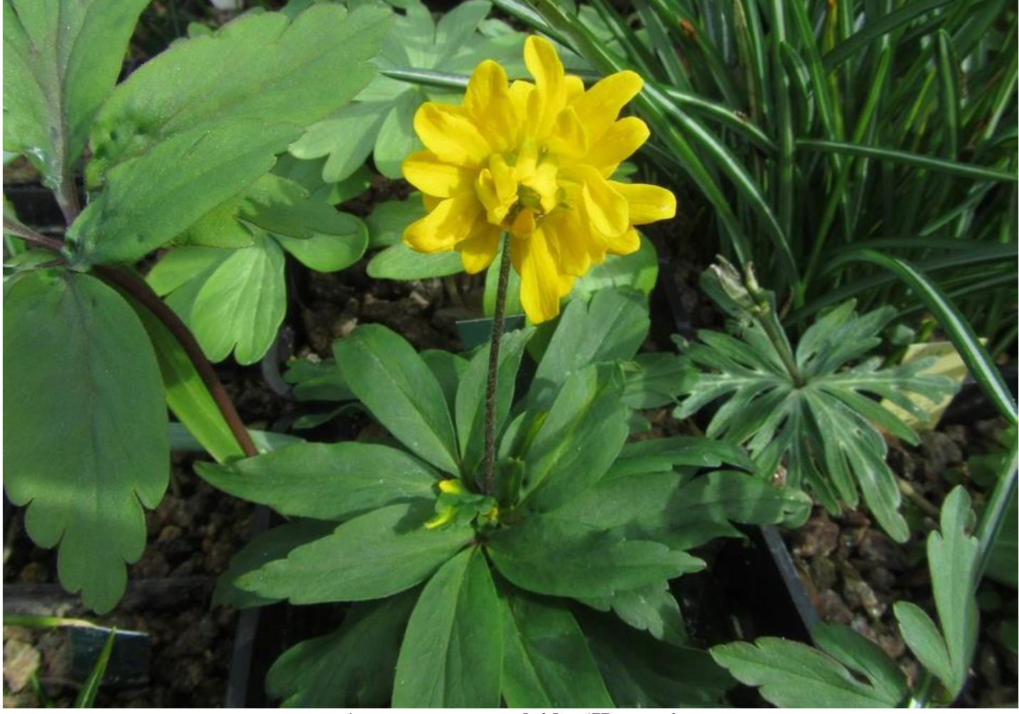
Anemone ranunculoides 'Hagerte'

Apparently it was after the nuclear fallout from the Chernobyl disaster that a lot of Anemone ranunculoides mutations were found, including this one. The first difference I noticed was the doubling up of the leaf forming a central ruff of leaf like structures the smallest of which were tinged with yellow, now the flower has developed I see it is a double.