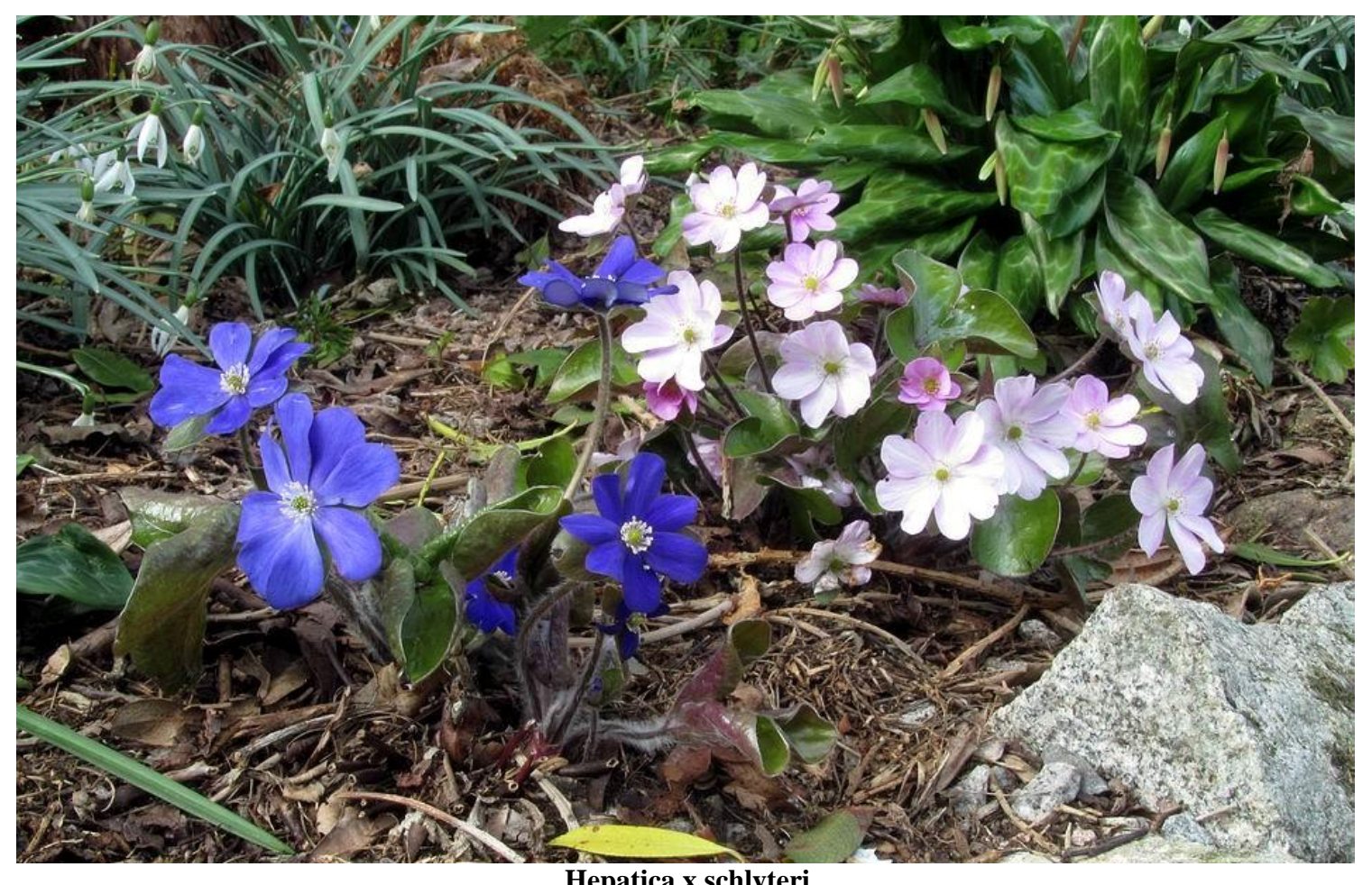
Hepatica x schlyteri Hepatica flowers are in evidence around the garden as they come into the peak season for flowering.