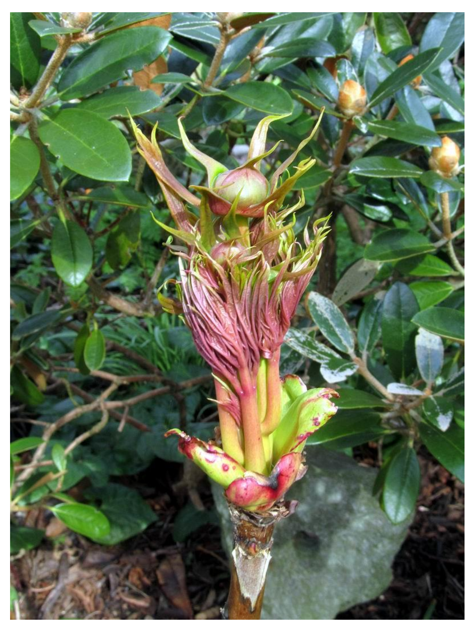
This is one of many self-sown seedlings from Paeonia lutea var. ludlowii that are growing all around the large parent plant. This one will flower for the first time but for now I can admire the beauty as the leaves and flower buds emerge from the bud then grow on to full size.