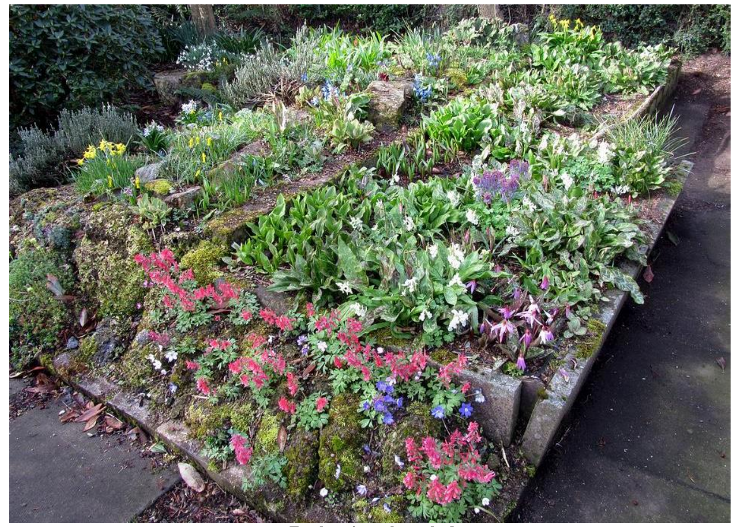
Erythronium plunge bed

When you grow a lot of Erythroniums in a relatively small area, as we do in our garden, cross pollination is inevitable and as a result many hybrids appear - one of the best selections we named 'Craigton Cover Girl'. The willingness to form clumps was one of the reasons that we named this form this group has formed from a single bulb planted five years ago.