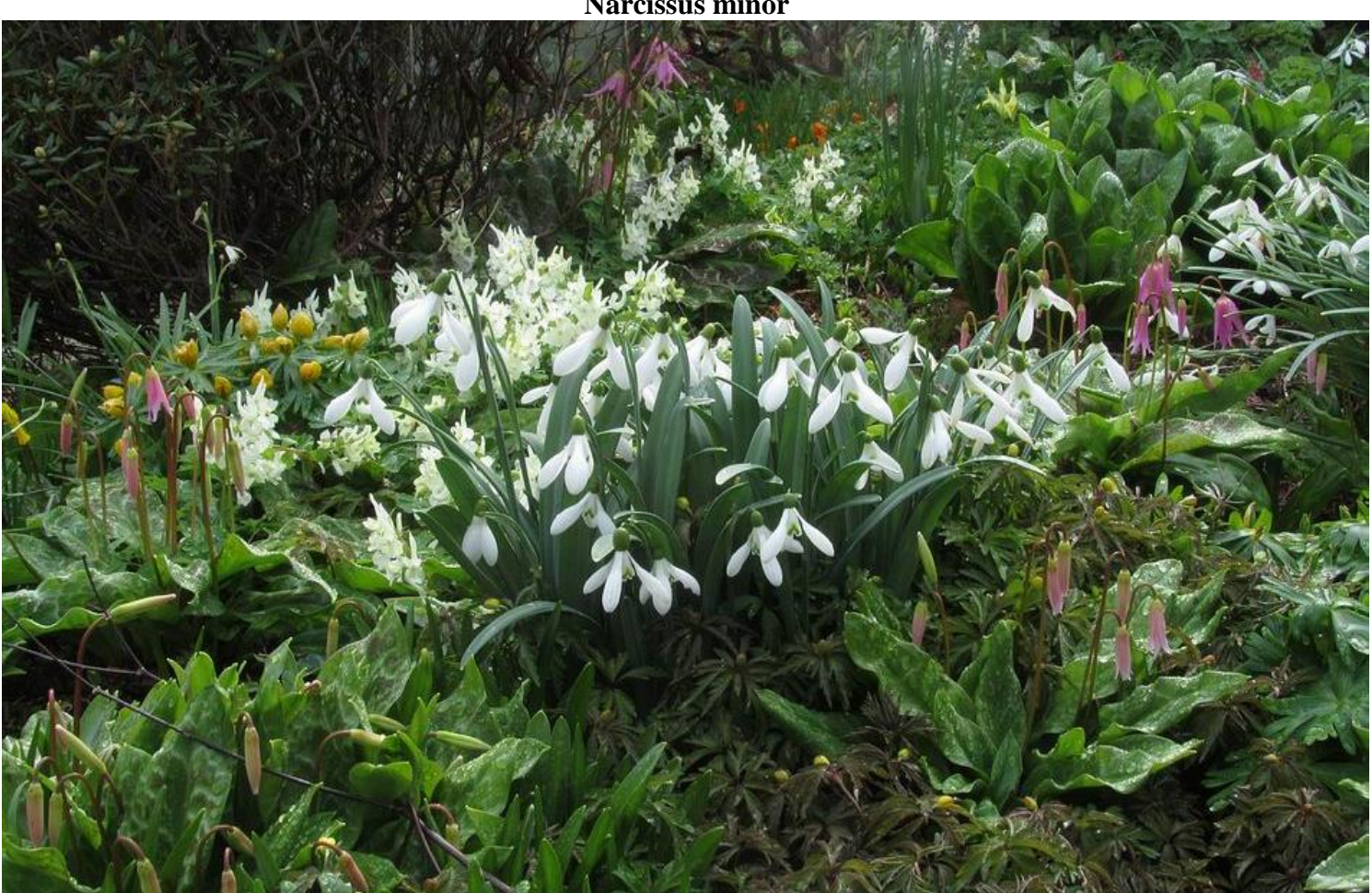
While some of the Galanthus flowers are now past, this one has just reached its peak of flowering.