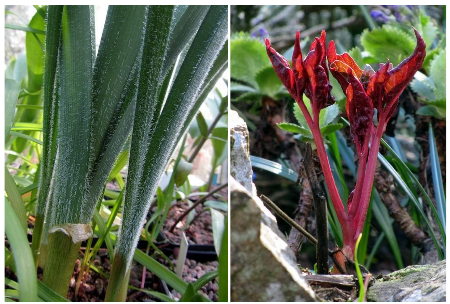
Allium and Peony Stems

Not all the hepatica forms and hybrids set seed but many like Hepatica pyrenaica will, when established, seed around.